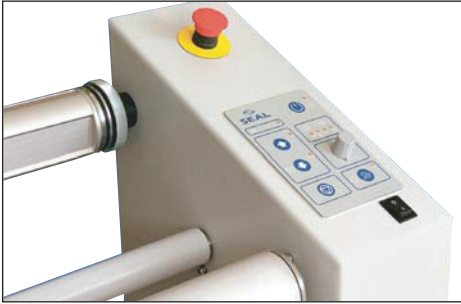
Ergonomic control panel for ease of use.